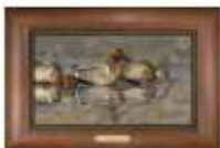
1. "Dabbling Greens" Canvas. Image is 29" x 23"